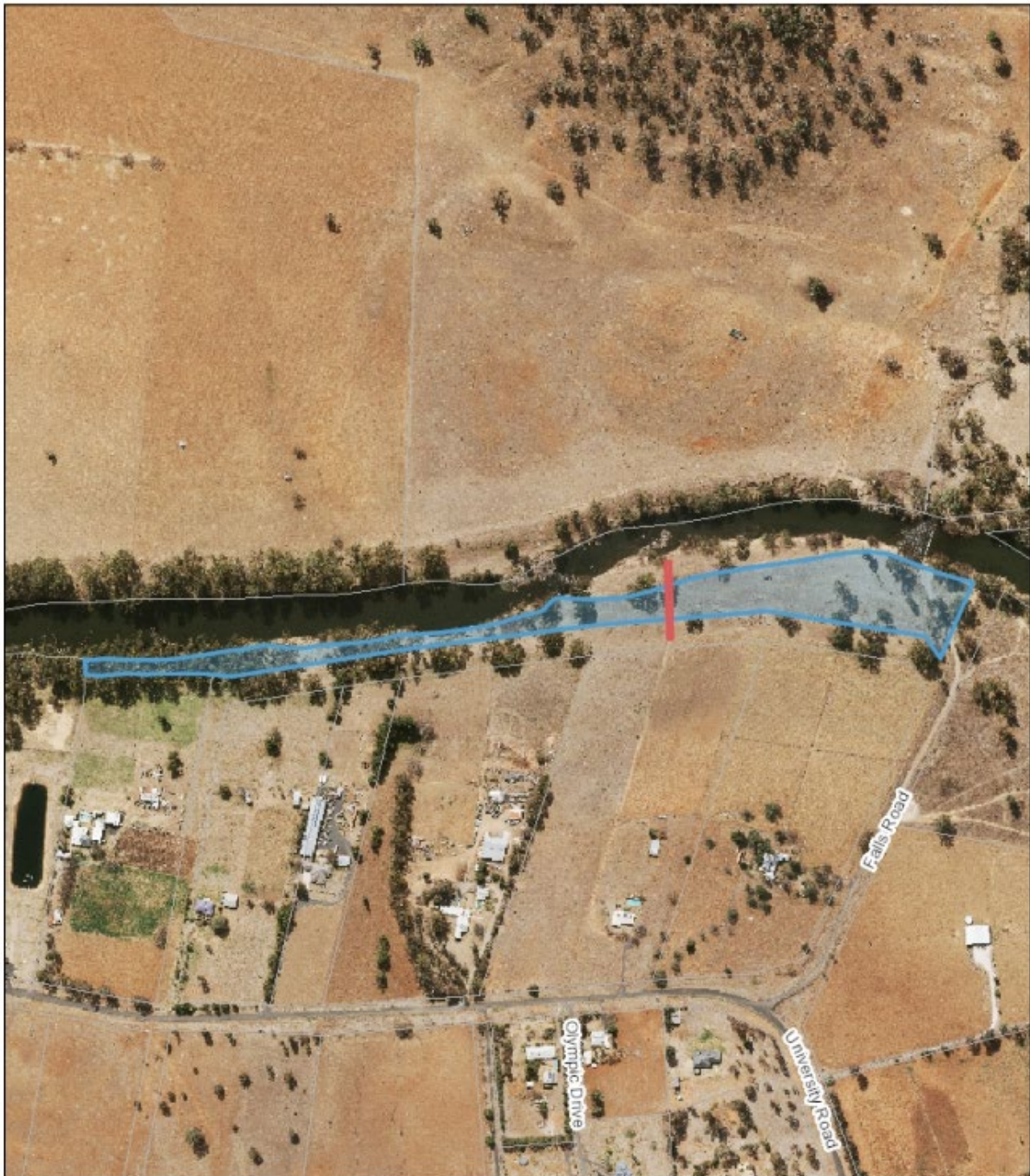
DIAGRAM SHOWING LICENCE AREA IN RED

DISCLAIMER - While every care is taken to ensure the accuracy of this data, the Dubbo Regional Council and the copyright owners, in permitting the use of this data, make no representations or warranties about its accuracy, reliability, completeness or suitability for any particular purpose and disclaim all responsibility and all liability (including without limitation, liability in negligence) for all expenses, losses, damages (including indirect or consequential damage) and costs which you might incur as a result of the data being inaccurate or incomplete in any way and for any reason. © State of NSW Land and Property Information (LPI) 2018 © Dubbo Regional Council 2018